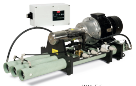
WM-E Series Record low power consumption