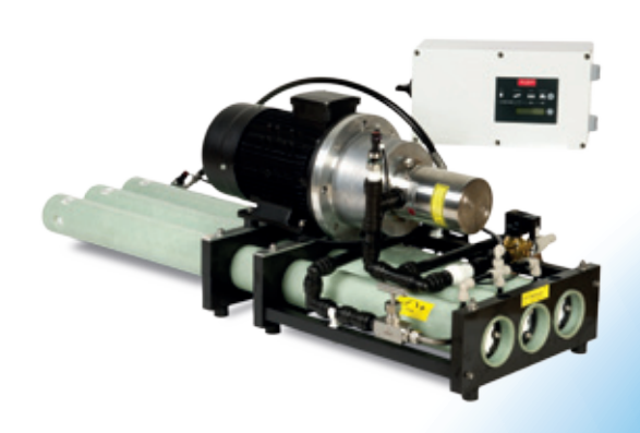
WM-B Series Economical yet high quality